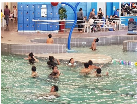
Henderson Wave Pool