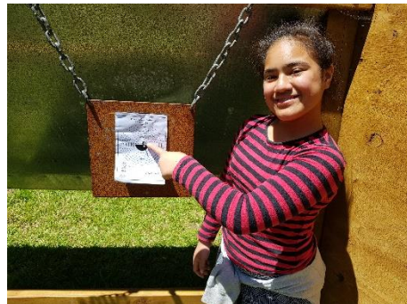
Maris Stella 'Get Your Gun'