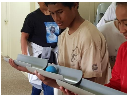
Teamwork Always Wins