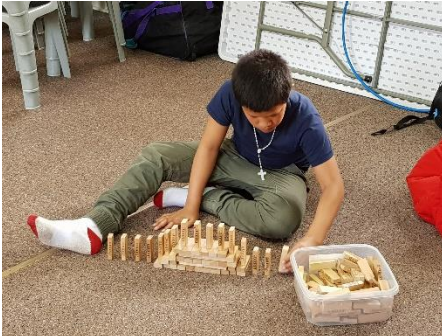
Steady . . .