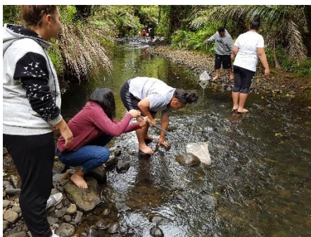
Stream Science (with cold feet)