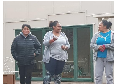
Judges Deliberating !!!

Unfortunately our planned Outdoor Education Camp to Piha had to be changed at the last moment as the Auckland City Council closed Piha Mill Camp because of potential flooding risk and danger. We were transferred to a new camp for us, Ferndale Lodge , but luckily just as much fun was had by our senior class from Wednesday to Friday last week. A range of activities were planned including air rifles, archery, out-door cooking, as well as stream science amongst the many other problem solving tasks. Special thanks to all the adult helpers who make these camps possible, as well as to the Lion Foundation for their grant which paid for most of the costs. On the way home we stopped into the West Wave Aquatic Centre in Henderson for a final swim. The balance of the costs came from our Bike Raffle which was won by