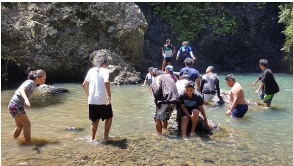
The famous Kitekite Falls