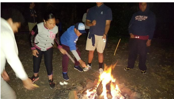
Toasting marshmallows 'Delicious'