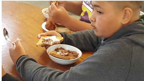
Cocoa Pops on Yogurt on Toast ???