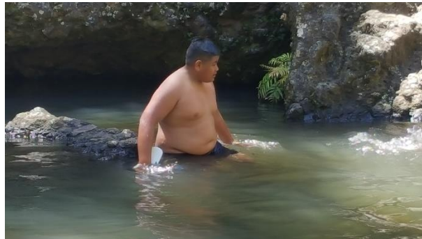
"Are there any eels in the water"?