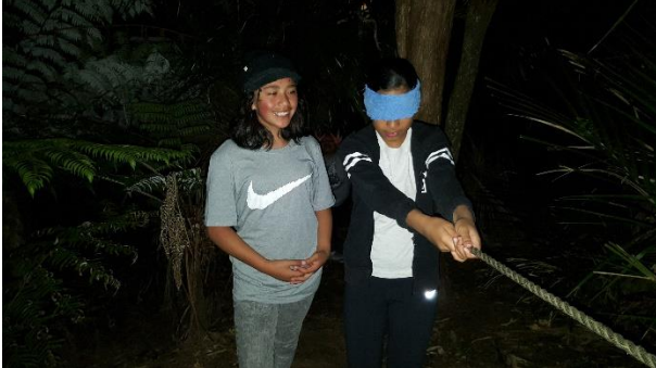
Burma Trail after dark. "I'm scared!"

Thanks to the Lion Foundation and Rotary Club of St John's for helping fund the camp.