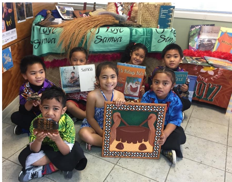
Getting into the spirit of Samoan Language Week