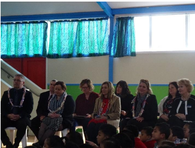
Our Australian Visitors

This week we were privileged to host a group of Catholic Principals from the Diocese of Cairns in Queensland . They were part of a bigger group who had come to visit the Manaiakalani Community of Learning as they had heard all about the great work we are doing to lift student achievement using technology. As part of their trip, they also visited other Catholic schools across Auckland, both primary and secondary. As is our way, the children put on a wonderful welcome liturgy using many of the languages from our community. Being Tongan Language Week , we even sang the New Zealand National Anthem in Tongan. After the welcome they spent the morning visiting each of our learning spaces and talking to the students about their learning. They remarked how confident our students were and how well they could explain what they were learning. This was far better than most of their own schools and in many of the other Auckland schools they had visited earlier in the week. We received a couple of lovely Australian children's books as a token of their thanks. They all promised to go home to their school and encourage their children to connect with ours through their blogs.