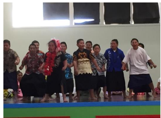
SENSATIONAL DANCING ROOM 5!