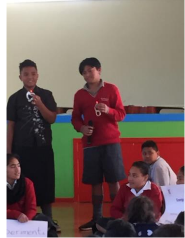
AMAZING MACKY & OPI!