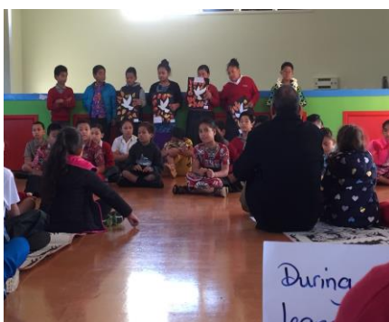
Brilliant Room 3 & Room 4!