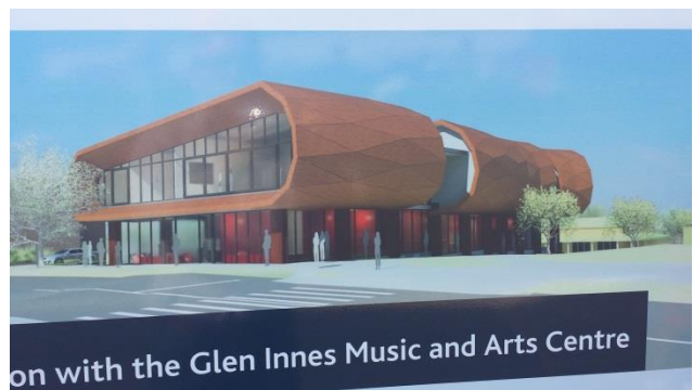
The New G. I. Music and Arts Centre